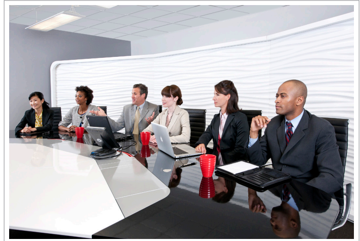
The Polycom OTX Solution

A majority of telepresence solutions in the market today are designed on industry standards and thus fully interoperable with no impact on user experiences. However, some vendors developed their telepresence offerings either as proprietary projects in response to a specific customer request, or as adjuncts to their existing portfolio of network products. Communicating with these closed systems, while not impossible, is complicated by their use of internal proprietary protocols and the need for intermediary gateways to establish connectivity. The result for users is often a degraded quality of experience and more costly and complicated deployments for IT departments. To sustain the long-term viability of any telepresence and video investment, forward-thinking organizations should seek to invest in standards-based telepresence solutions, most often characterized by widely-recognized protocols such as H.264 video compression, H.239 content sharing, and AES security encryption.