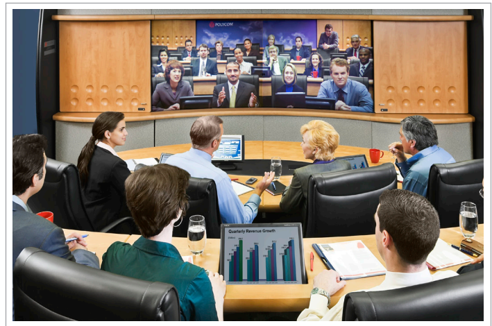
The Polycom® RealPresence Experience™ (RPX™) Solution

Telepresence solutions extend real-time collaboration between organizations and enable customers and partners to become part of your video ecosystem—securely, easily, and affordably. By using standards-based telepresence systems, teams and individuals can collaborate in either point-to-point or multipoint calls, through video or audio, and share content in high definition quality. And as Unified Communication (UC) applications, such as Microsoft® Office Communications Server (OCS) and IBM® Lotus® Sametime®, increasingly become video-empowered, the ability of telepresence to improve productivity, reduce costs, and improve decision-making is extended to more users and becomes part of the telephony, email, and mobility tools they already use.